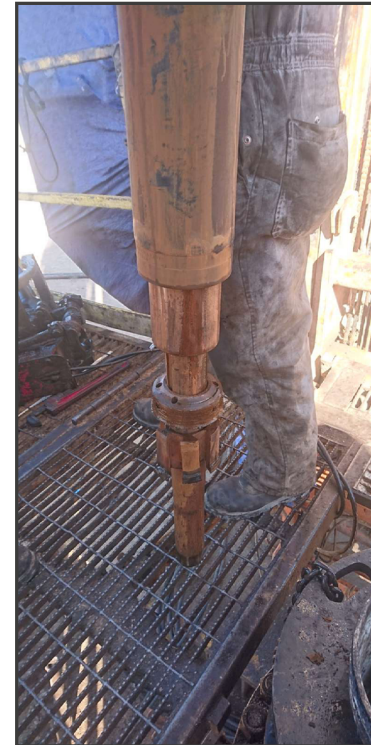
7" AD1 Packer Mandrel and Upper Slips

"Our well made oil today for the first time in a long time due to your tool, we would certainly recommend Ardyne for any tough fishing job." - VP Operations, US Land Operator